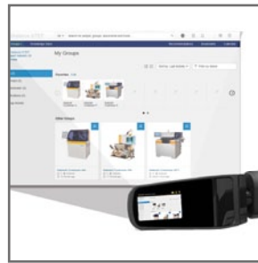
Satisloh Assisted Reality Headset screen close-up

Satisloh's newest technical support offering, Distance STEP, gives subscribers remote access to company experts for on-demand help – reducing the need for on-site technician visits.