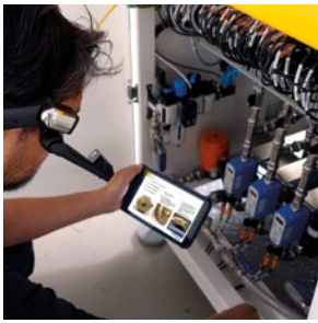
Immediate access to Satisloh's Knowledge base