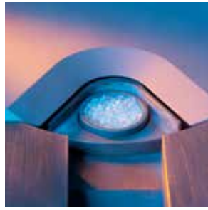
Electron beam gun