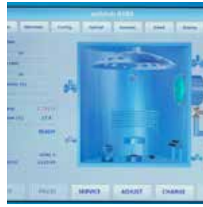
User-friendly HMI software