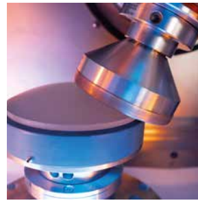
Spherical grinding for \varnothing 10-150 mm