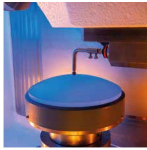
CT measuring system