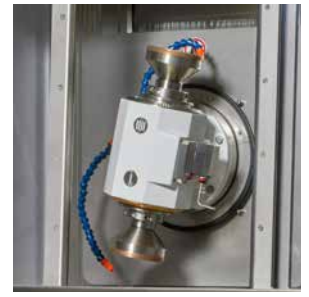
Dual spindle on SPM-150 (optional on SPS-150)