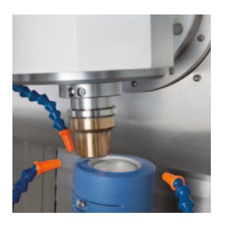
Aspherical polishing with ADAPT (2D)