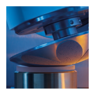
Spherical polishing up to Ø 125 mm