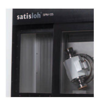
Dual spindle on SPM-125 (optional on SPS-125)