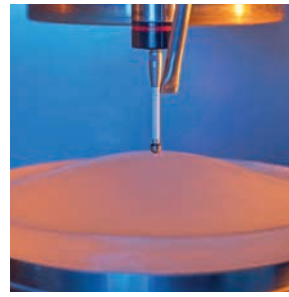
OMM touch measuring system for center thickness and form verification