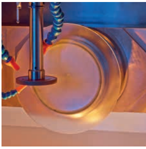
Processing of diameters up to 500 mm