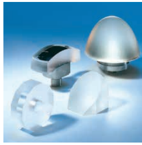
Multiple applications: spheres, aspheres, plano optics and prisms