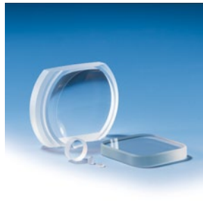
Processing of various geometries, including non-circular lenses