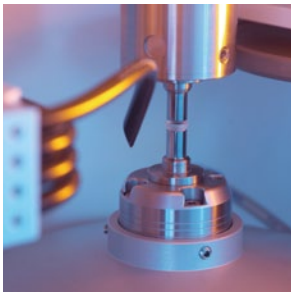
High precision centering for Ø 1-50 mm