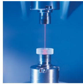
Precise and fast: laser alignment system