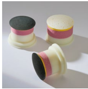
Intelligent polishing tools with embedded RFID tag