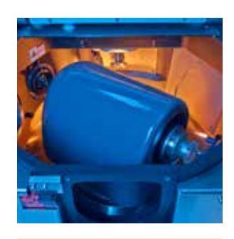
Orbital alignment of tool axes with robust work-piece spindle (B-axis).