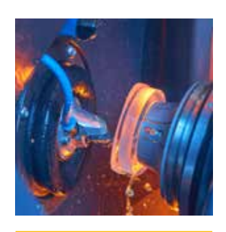
Through Tool Cooling cools down cutting point of the tool.