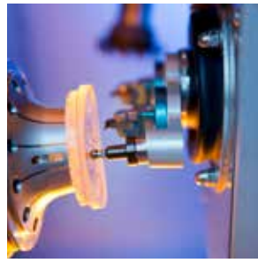
Auto-calibration of tools.