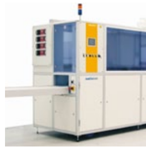
Hydra-sonic-40 fully automated ultrasonic cleaning system