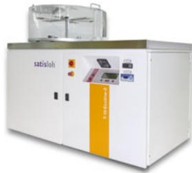
Hydra-sonic-10 compact "plug and wash" system