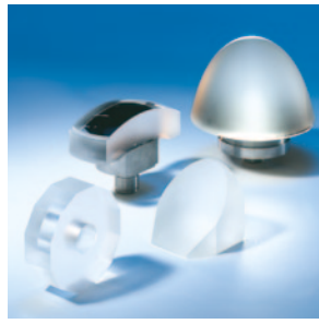
Multiple applications: spheres, aspheres, plano optics and prisms