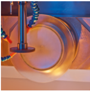
Processing of diameters up to 500 mm