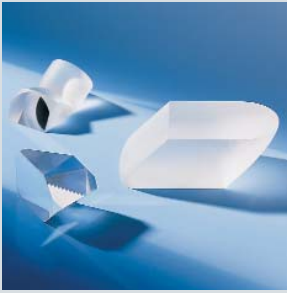
Universal: The PR-150-SL processes surfaces including radii of numerous different kinds of prisms.