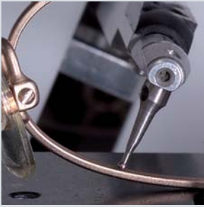
Dimension automatically adjusts stylus pressure for delicate frames