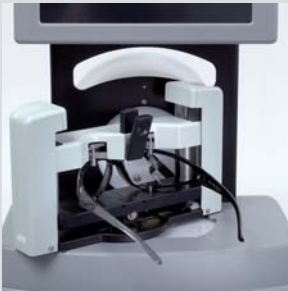
The rotating frame table allows to trace even the highest wraps with maximum precision