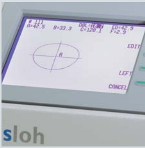
4Ti's integrated monitor allows to review the traced shape