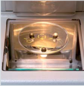
3B blocks the lens face down to avoid lens damage and errors due to imbalance