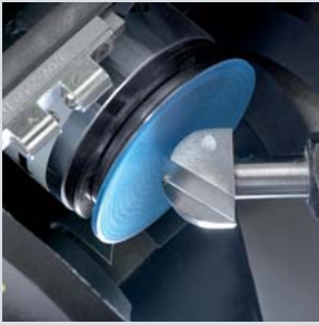
The 32 mm PCD cutter of the V-35 processes all organic materials at high speed