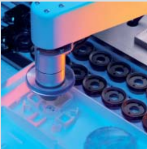
Automatic loading and unloading of lenses