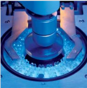
Video recognition system for precise lens alignment