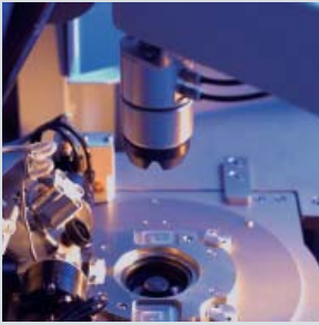
Automatic placement of blocking chuck into the blocking station