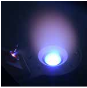
High output ion/plasma source (optional)