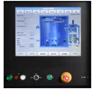
User-friendly HMI software