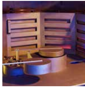
Intelligent movable shields