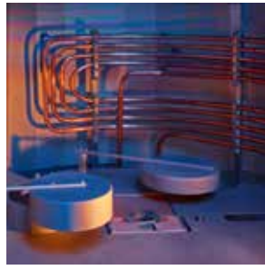
Larger Meissner trap