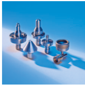
Tools for generating, polishing and dressing