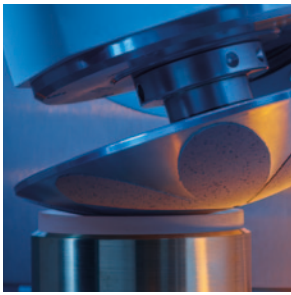
Spherical polishing up to \varnothing 125 mm