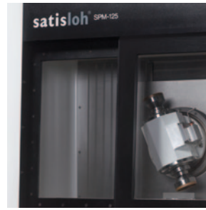
Dual spindle on SPM-125 (optional on SPS-125)