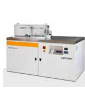
Hydra-sonic-10 compact "plug & wash" system