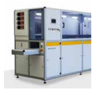
Hydra-sonic-40 fully automated ultrasonic cleaning system